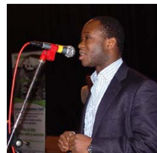
East Surrey MP Sam Gyimah officially opened the second Volunteer Fair.